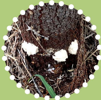
White egg mass