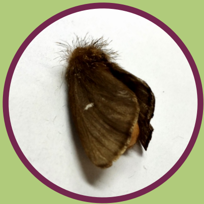
Adult female moth