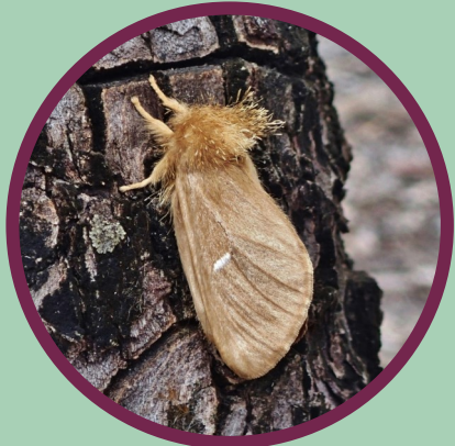
Adult female moth