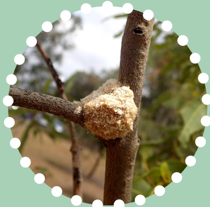
Golden egg mass